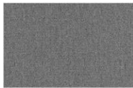
• AB -03