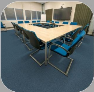
ABSOLUTE AB - 05