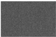
• AB -02