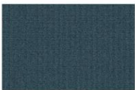
• AB -05