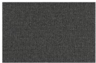
• AB -01