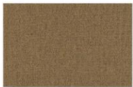
• AB -04